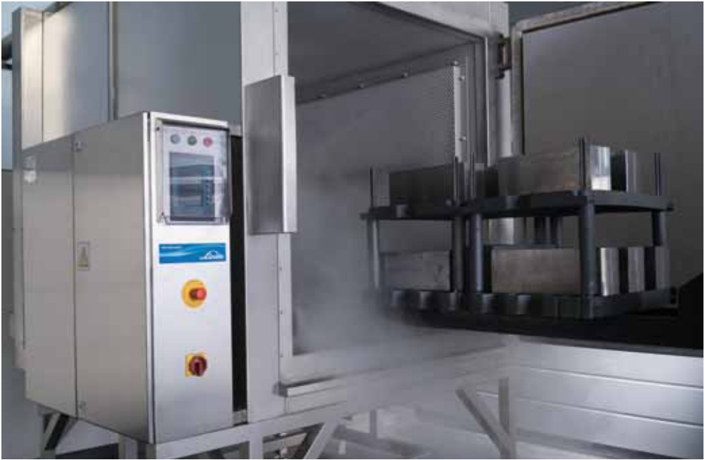
Loading of a CRYOFLEX cabinet